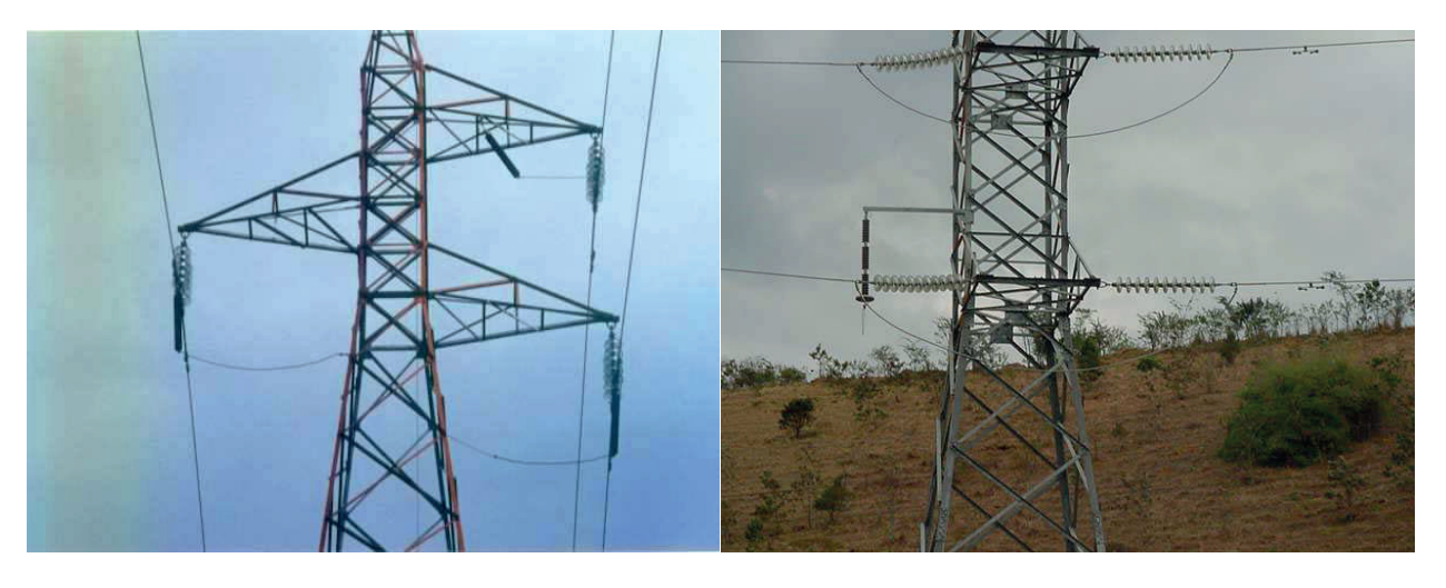
Figure 4 - Line arresters installed on 138 kV lines: Left - CEMIG / Right - UTEJF

The analysis and evaluation of the Brazilian's overhead line lightning performance expressed as the average number of outages per a hundred kilometers a year before and after the line arresters