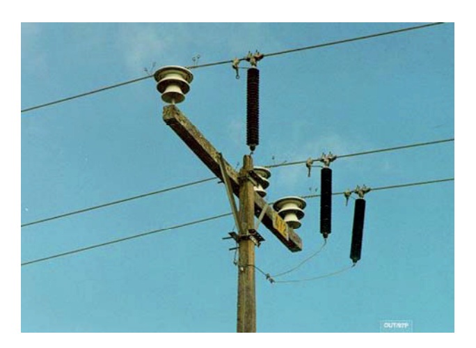
Figure 2 – Line arresters installed on 34.5 kV line – CEMIG [1]

technical and economical point of view, lightning performance estimate studies have usually been performed to select the appropriate line arresters characteristics and to optimize the quantity and location of the line arresters along the more critical sections of the overhead lines [14-18].