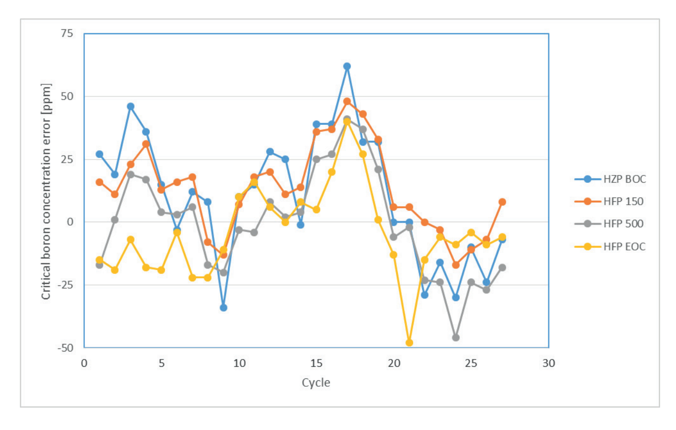
Figure 2: Critical boron concentration differences (C-M)

Averaged differences and standard deviation are presented in Table 1. A slight tilt smaller than 18 ppm from the BOC to EOC critical boron concentration can be observed confirming good CORD-2 burnout prediction capabilities. Standard deviation of results is within 25 ppm, therefore there is the 95% confidence that predicted critical boron concentrations are within \pm 50 ppm band.